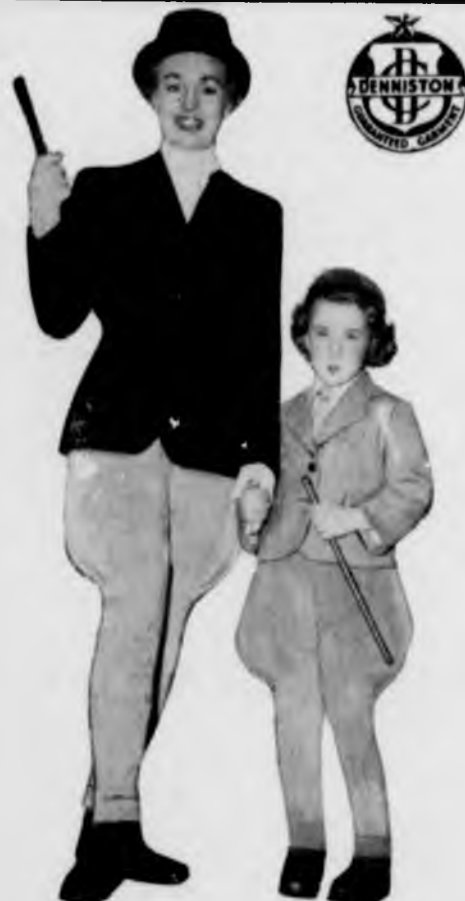
Outright Winners in their Class

CLASS 60—Novice Heavy-weight Hack. Open to all horses, over 14.2 hands, which have not won a first, second or third prize in a class for hacks at any Royal Show in Sydney, Melbourne,