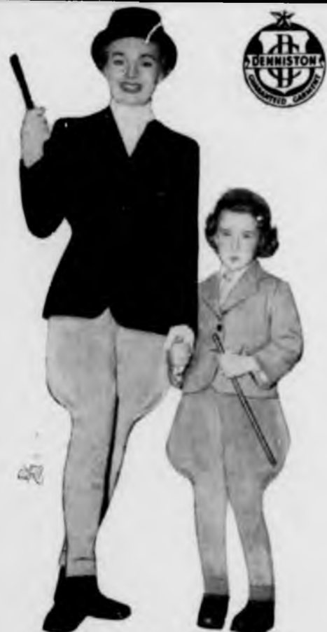
Outright Winners in their Class

CLASS 60—Novice Heavy-weight Hack. Open to all horses, over 14.2 hands, which have not won a first, second or third prize in a class for hacks at any Royal Show in Sydney, Melbourne,