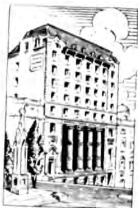
PERPETUAL TRUSTEE COMPANY LIMITED