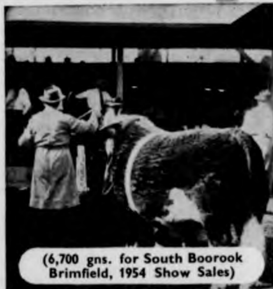
(6,700 gns. for South Boorook Brimfield, 1954 Show Sales)

because their clients are BIGGER BUYERS of BETTER BULLS!