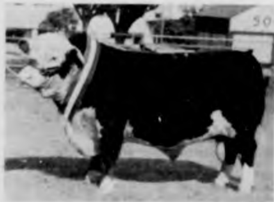
SOUTH BOOROOK BRIMFIELD

The Bective Hereford Stud was founded in 1929 with the purchase of females from Hobartville, Golf Hill, Ennisview and Mount Leonard and Glengarry dispersal sales. Since then the best sires sold in Sydney have been procured and used in the Stud (the latest addition being South Boorook Brimfield, purchased at 1954 Show Sales for 6700 gns.) with the result that the Stud is finding ready sale for both males and females that are offered, and has also figured prominently in the Show ring in Sydney and Brisbane and locally. The aim of the breeders is to produce soft, early-maturing, well-marked types of cattle with good heads, broad in the buttocks and standing square on their feet. Bective bulls meet with ready sale when offered and universally purchasers' comments are very encouraging and pleasing to the breeders.