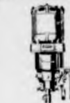
VERTICAL SHEARING GEAR

REMEMBER! When you buy Cooper you buy a product which is 100% Australian made, ensuring a continuity of spare parts and a guaranteed after sales service.