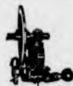
MASTER MODEL OVERHEAD GEAR