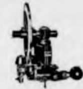
MASTER MODEL OVERHEAD GEAR

Invitation Sunbeam Corporation Ltd. extend a very cordial welcome to all country, interstate and New Zealand visitors. You are specially invited to see our factory at Mascot, N.S.W. A phone call to the Cooper Sales Department (MU 047) will take care of your transport to and from your city address — be our guest for lunch, we'll be glad to see you.