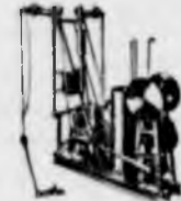
SELF-CONTAINED SHEARING PLANTS