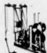
SELF-CONTAINED SHEARING PLANTS