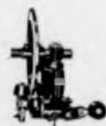
MASTER MODEL OVERHEAD GEAR