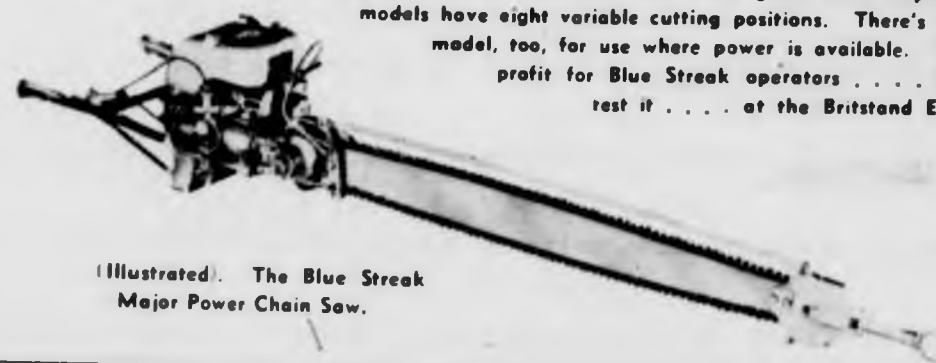
(Illustrated). The Blue Streak Major Power Chain Saw.

Definitely in the world champion class are the Blue Streak models. The MAJOR—a Two-man, petrol-driven model—has already established new records in timber getting. The MINOR, a handy one-man petrol-driven saw now has attachments to dig post-holes, drill posts and even grind form implements. Both models have eight variable cutting positions. There's an ELECTRIC model, too, for use where power is available. There's bigger profit for Blue Streak operators . . . see it . . . rest it . . . at the Britstand Exhibit.