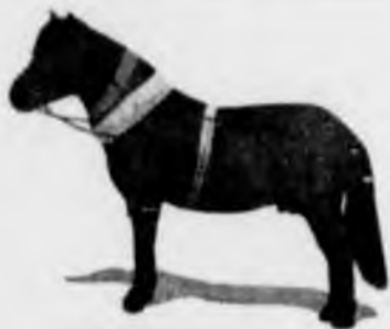
GEM OF MANAR (Imp.)

Pedigree Colts and Stallions also Children's Ponies when available.