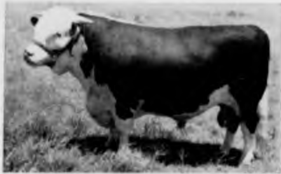
ANKERDINE ZENITH (Imp.)

The Bective Hereford Stud was founded in 1929 with the purchase of females from Hobartville, Golf Hill, Ennisview and Mount Leonard and Glengarry dispersal sales. Since then the best sires sold in Sydney have been procured and used in the Stud with the result that the Stud is finding ready sale for both males and females that are offered, and has also figured prominently in the Show ring in Sydney and Brisbane and locally. The aim of the breeders is to produce soft, early-maturing, well-marked types of cattle with good heads, broad in the buttocks and standing square on their feet. Bective bulls meet with ready sale when offered, and universally purchasers' comments are very encouraging and pleasing to the breeders.