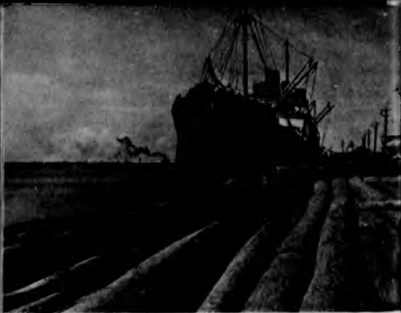
Timber for export, Newcastle wharves.

an industry on its own, while a review of wood-derivatives discloses a never-ending line of materials: paper, tannic acid for tanning hides, floor tiles and fire logs from sawdust, edible sugar, alcohols, turpentine, rosin, pine oil, cellulose from which again is derived rayon, artificial wool, cellophane, explosives, celluloid, collodian, cellulose lacquer . . . and so one might go on and on.