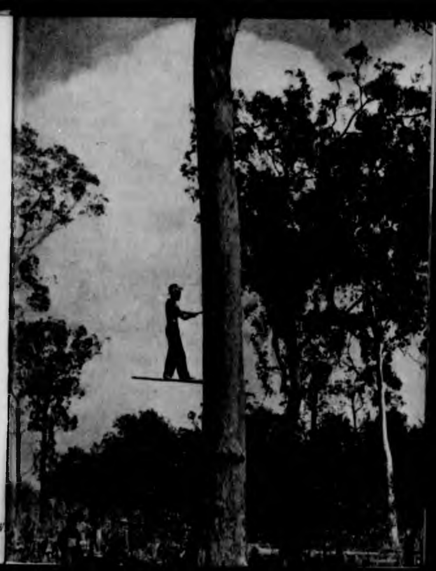
Opp. : Felling Spotted Gum—N.S.W.

AXES - HATCHETS - CLAW HAMMERS TINSNIPS - MULTIGRIPS Etc.