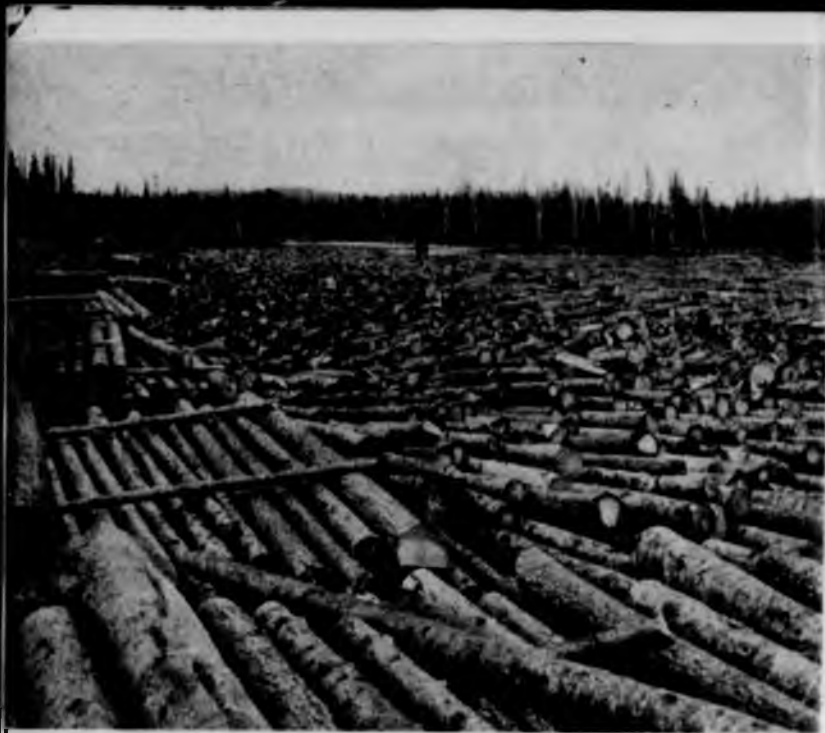
Floating paper pulp logs in Canada.

sawing section. The popularity of the events spread to country shows throughout the land. No annual district carnival was complete without its wood-chopping and sawing contest, and the