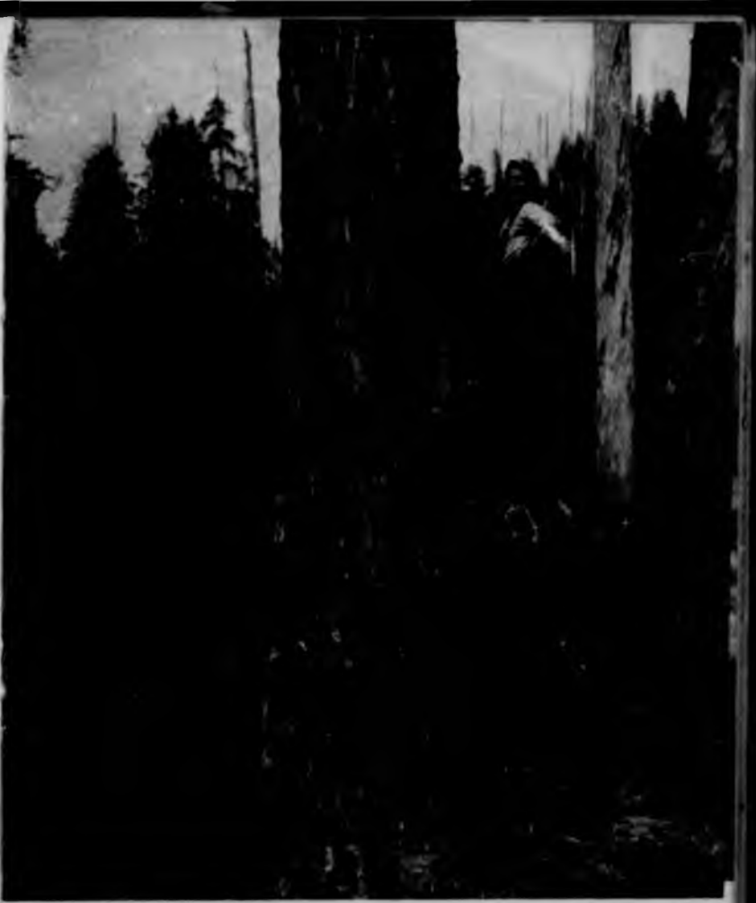
Preparing to top a Douglas Fir—Canada.