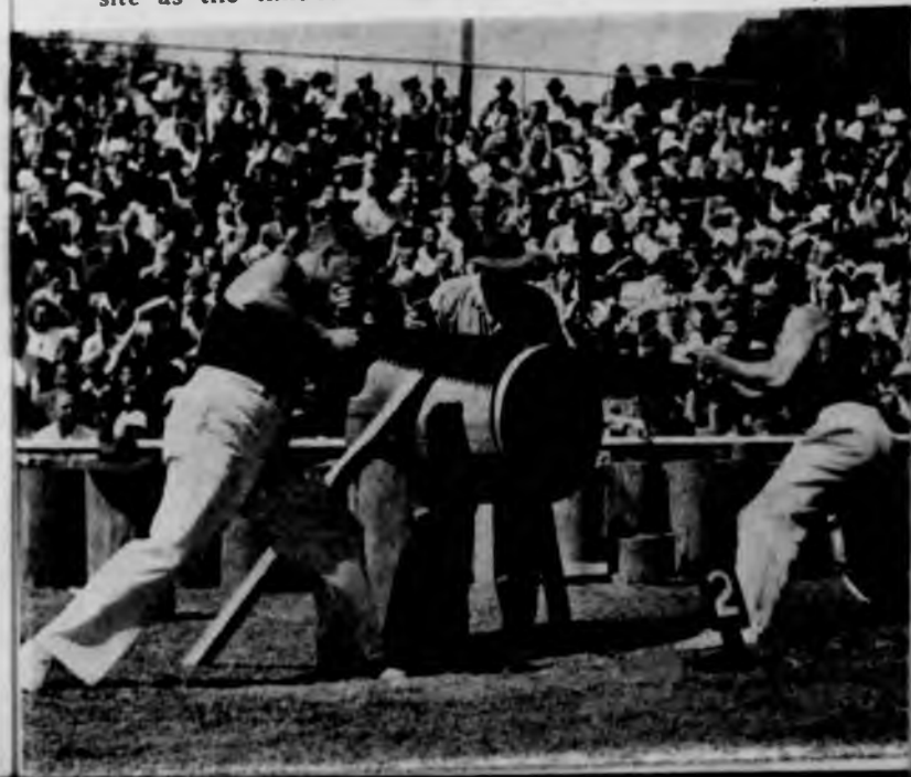
Opp. : Championship wood-sawing contest—Sydney.

first world war, steps had to be taken to overcome the shortage of manpower for tree felling, and it is claimed that the idea and development of the power chain saw actually took place in the offices of the British Columbia Logging Association in Vancouver. These chain saws are designed for operation by one or two men, and they do the work in half the time taken by the manual cross-cut saw. Then there are the portable and semi-portable all-steel saw edgers and trimmers, and even up-to-date complete portable sawmills which may be moved easily from site to site as the timber is cut out.