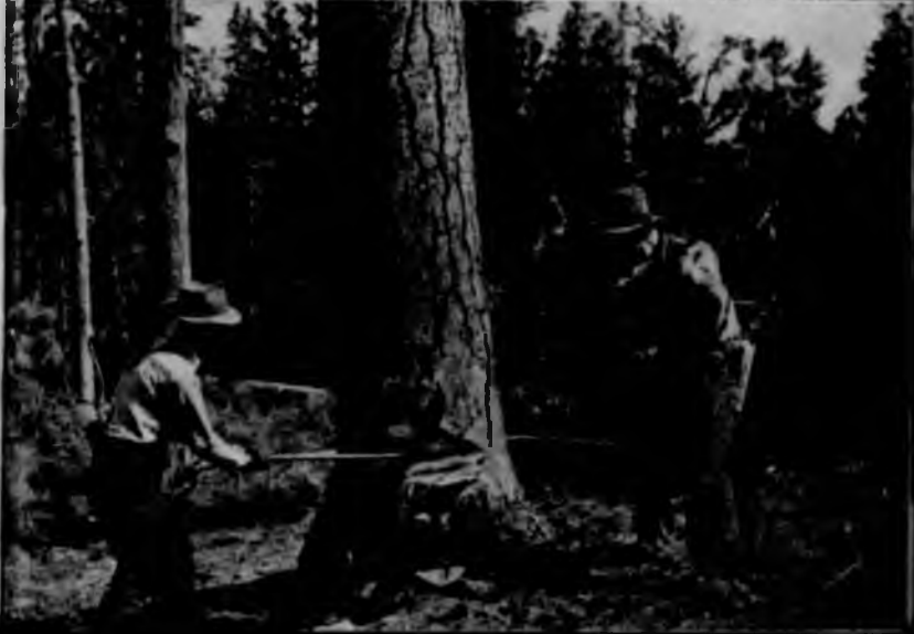
Opp. : (Top)—Operating a chain saw : (Below)—Canadian axemen at work.