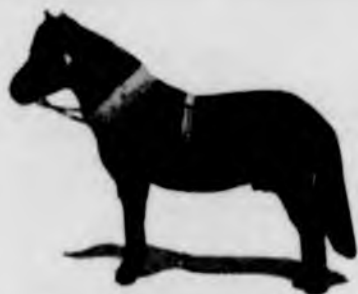
GEM OF MANAR (Imp.)

Pedigree Colts and Stallions also Children's Ponies when available.