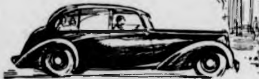
2½ LITRE POST-WAR DAIMLER

The Bodywork has had slimming treatment. Result—very generous interior width and head room—more luggage space too!