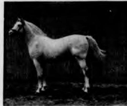
Arabian Stallion, RAKIB (imp.)

Reg. Weatherby's G.S.B. and Arab Horse Stud Book. Fully booked last season. Bookings now being accepted for 1949 season.