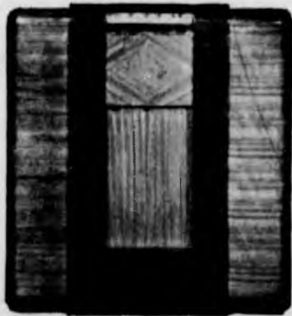
The New Console, 5-valve, Dual wave model—BC1131 £51/9/-

Genalex radios are noted for unsurpassed reception. They incorporate post-war improvements and those unique features: instant roller tuning and concealed controls. Available in Console, Table, Mantel and Miniature Portable Models, the Genalex range meets every need and the most fastidious taste. Console and Mantel Models, specially designed for battery operation in country areas, give noteworthy reception.