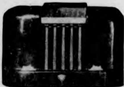
The 'Dapper' Mantel—4 or 5-valve, A.C. or battery operated from £19/19/-

Genalex radios are noted for unsurpassed reception. They incorporate post-war improvements and those unique features: instant roller tuning and concealed controls. Available in Console, Table, Mantel and Miniature Portable Models, the Genalex range meets every need and the most fastidious taste. Console and Mantel Models, specially designed for battery operation in country areas, give noteworthy reception.