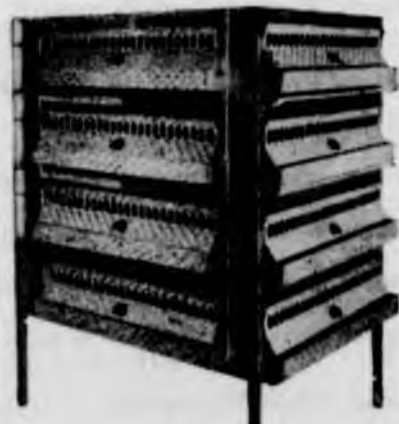
Poultry Drinkers, Valves, Wire Floors, Egg Graders, Poultry Equipment.

Also, "Multiplo" Electric Hover Brooders, 150 and 300 chick sizes. 2 inch cork insulation, constant heat system, clear top and covered controls.