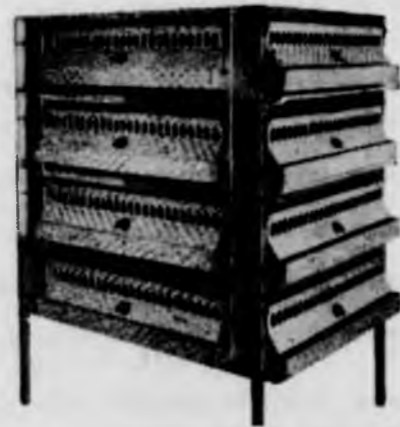
Poultry Drinkers, Valves, Wire Floors, Egg Graders, Poultry Equipment.

Also, "Multiple" Electric Hover Brooders, 150 and 300 chick sizes. 2 inch cork insulation, constant heat system, clear top and covered controls.