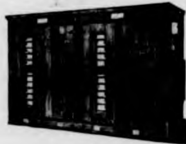
72, 200 and 400 kerosene heated incubators, with alternative Electric heating Unit.

World renowned for hatching eff. hatch hen, duck, and turkey eggs perfectly. 1,350, 2,700, 4,200, 5,100, 6,300, 7,150, 8,400, 10,200 Electrics. Separate Hatchers and Large Setters to requirements.