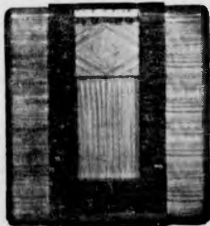
The New Console, 5-valve, Dual wave model — BC1131 ..... £51/9/0

Genalex radios are noted for unsurpassed reception. They incorporate post-war improvements and those unique features: instant roller tuning and concealed controls. Available in Console, Table, Mantel, and Miniature Portable Models, the Genalex range meets every need and the most fastidious taste. Console and Mantel Models, specially designed for battery operation in country areas, give noteworthy reception.