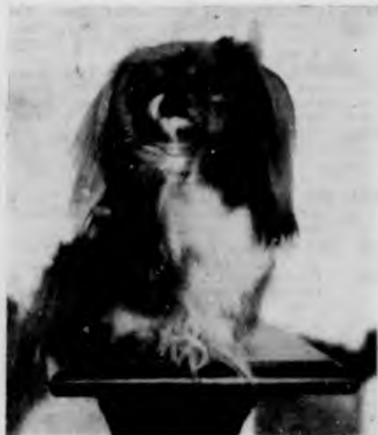
KC. CH. FO

This Kennel has been built up to the present standard over a period of 30 years