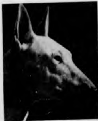
Grand Champion White Knight of Oxford.

Country Boarding Kennels . . . . . 85 Acres of Park Lands