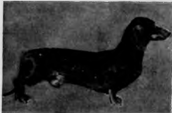
BARON OF EDELBLUT (imp.)

Winner of Championships in England before being imported. (A proven sire)