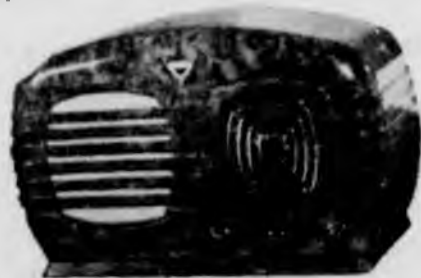
The "Dapper" Mantel — 4 or 5-valve, A.C. or battery operated, from ..... £18/18/0

Genalex radios are noted for unsurpassed reception. They incorporate post-war improvements and those unique features: instant roller tuning and concealed controls. Available in Console, Table, Mantel, and Miniature Portable Models, the Genalex range meets every need and the most fastidious taste. Console and Mantel Models, specially designed for battery operation in country areas, give noteworthy reception.