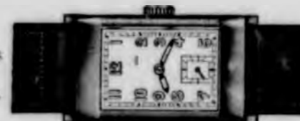
ALL MAKES IN STOCK.

Gent's Omega superb movement, 9ct. gold, £10/15/-. Stainless Steel, £9/9/-.