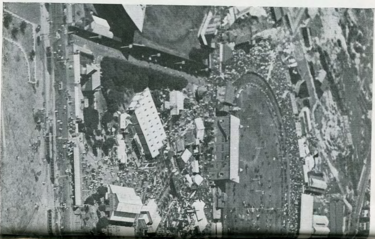
First Photograph from