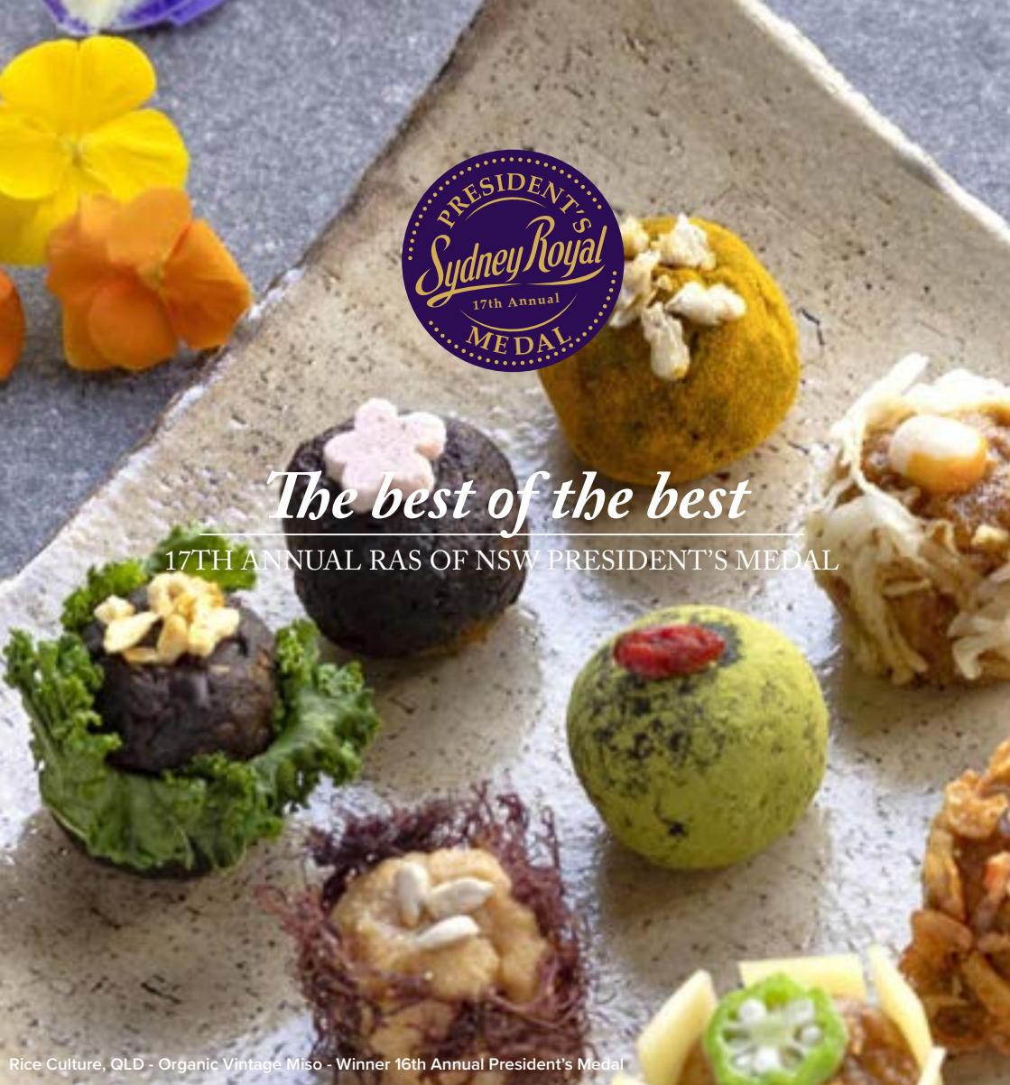
Rice Culture, QLD - Organic Vintage Miso - Winner 16th Annual President's Medal

17TH ANNUAL RAS OF NSW PRESIDENT'S MEDAL