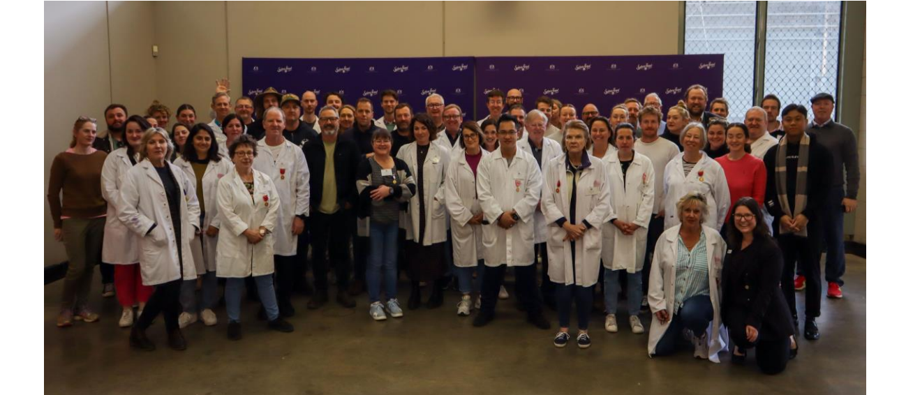
2023 Sydney Royal Wine Show Officials.

The RAS Wine Committee is committed to following the 2020 Wine Show Best Practice Recommendations developed by the ASVO, which expresses the current industry view on what constitutes best practice in the Australian wine show system which can be found at <a href="https://crm.asvo.com.au/sites/default/files/uploaded-content/website-content/decuments/asvo">https://crm.asvo.com.au/sites/default/files/uploaded-content/website-content/decuments/asvo</a> 2020 wine show bprs 2000903.pdf