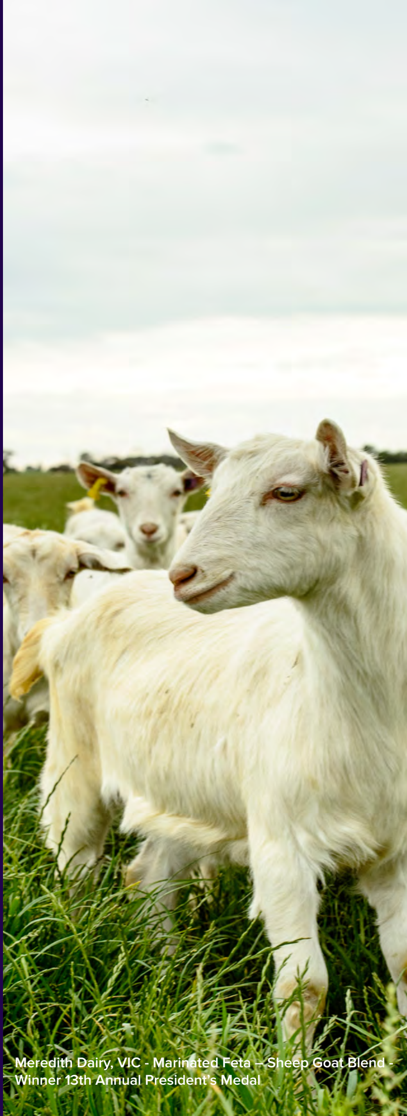
Meredith Dairy, VIC - Marinated Feta – Sheep Goat Blend - Winner 13th Annual President's Medal