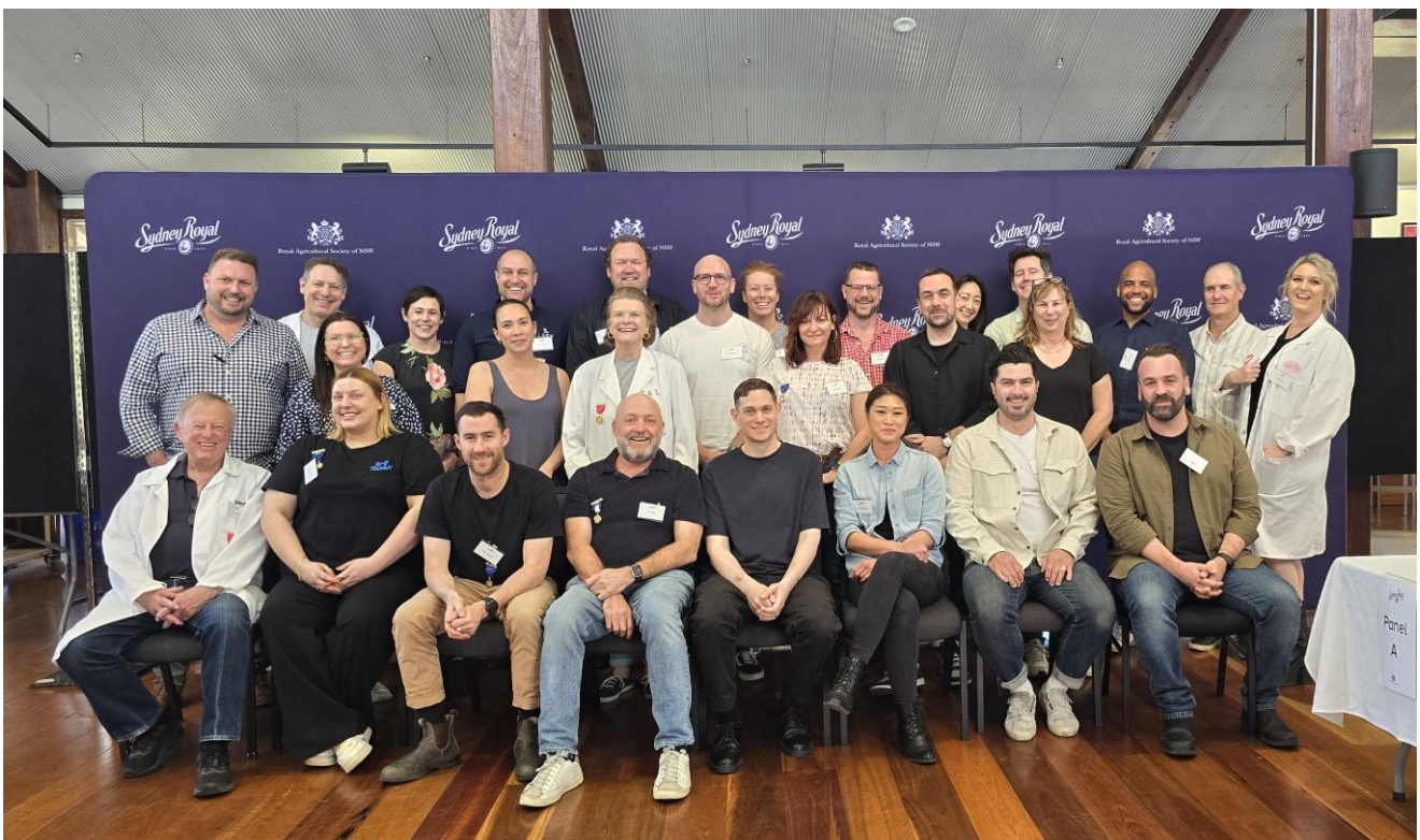
Sydney Royal Distilled Spirits Show Officials

https://www.rasnsw.com.au/competitions/food-beverage-and-produce/distilled-spirits/?currentTab=Judging-and-stewarding