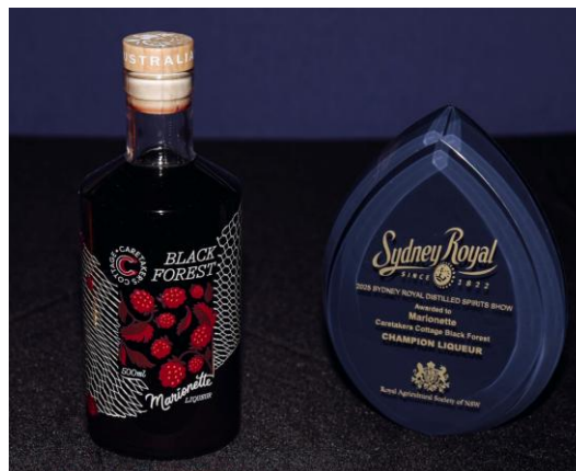
19 th Annual Presidents Medal Finalist Marionette – 2025 Sydney Royal Distilled Spirits Champion Liqueur

For more information visit the Presidents Medal webpage rasnsw.com.au/presidentsmedal