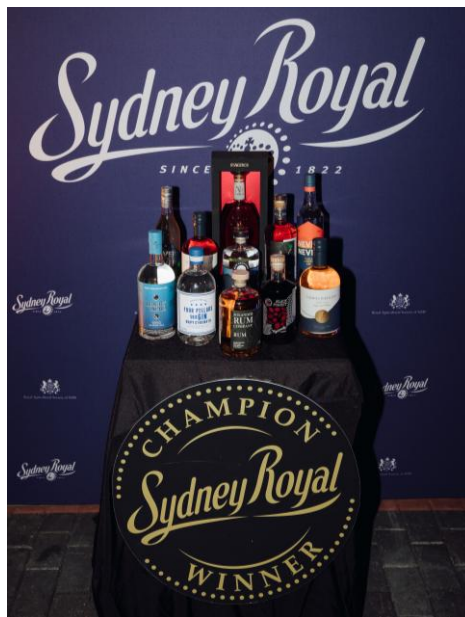
2025 Sydney Royal Distilled Spirits Champion Products

Invitations will be extended to all Championship and Special Prize-Winning Exhibitors to attend this evening event, offering two (2) tickets per successful Exhibitor.