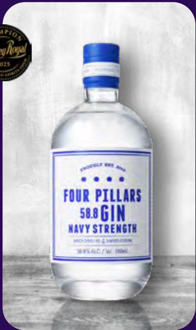
Champion Other Gin