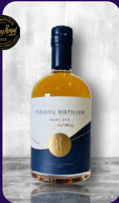
Champion Grain or Blend Whisky