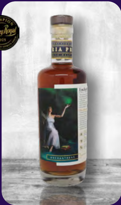
Champion Single Malt Whisky