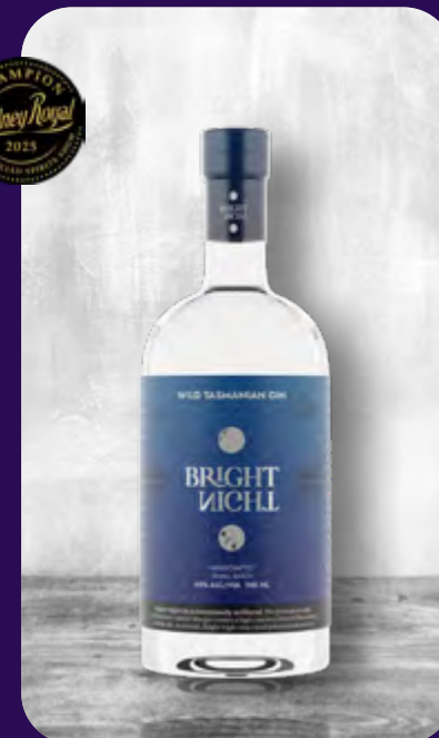
Champion Contemporary Gin

BRIGHT NIGHT SPIRITS BRIGHT NIGHT WILD TASMANIAN GIN