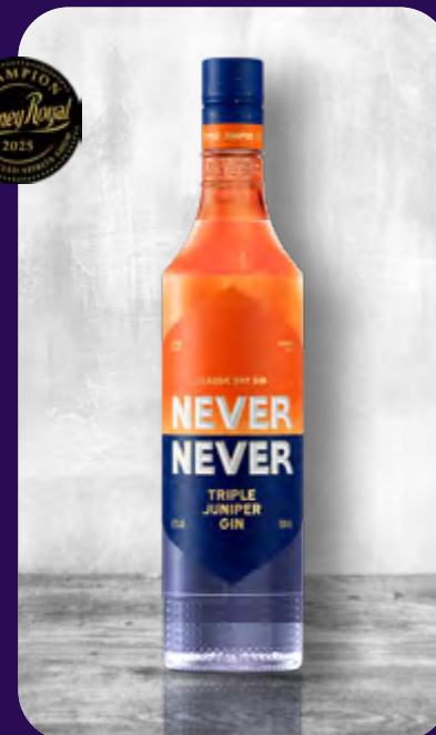
Champion Traditional Gin

NEVER NEVER DISTILLING CO TRIPLE JUNIPER GIN