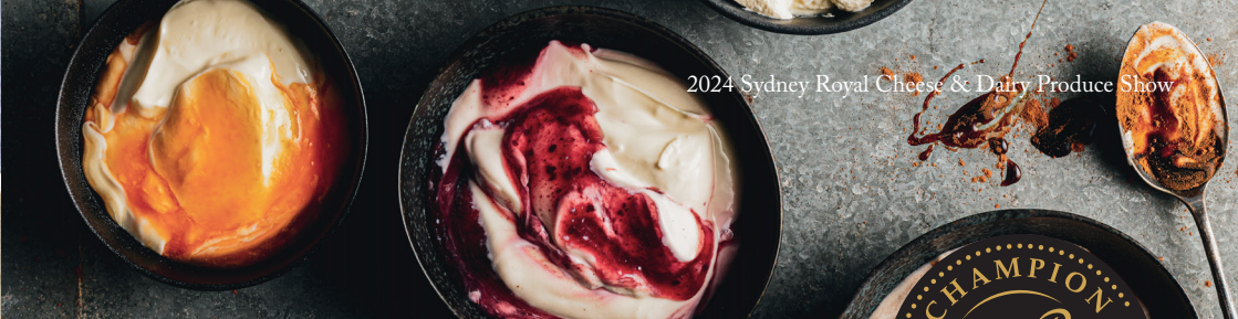
2024 Sydney Royal Cheese & Dairy Produce Show