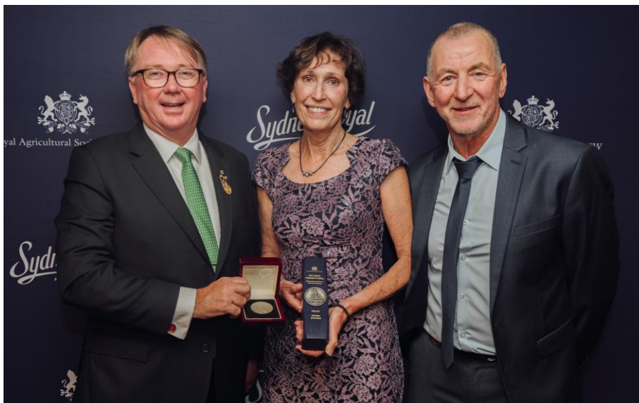
18 th Annual RASNSW Presidents Medal Winners - Tathra Oysters, who were also winners of the 1 st Annual Presidents Medal in 2006

For more information visit the President Medals webpage rasnsw.com.au/presidentsmedal