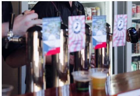
Grape Grain & Graze Festival Beer Tastings featuring Champion products