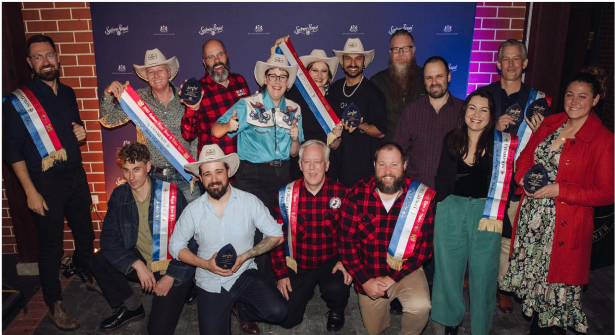
2025 Sydney Royal Beer & Ciders Show Champion Winners at the Awards function.

Invitations will be extended to all Championship and Special Prize-Winning Exhibitors to attend this evening event, offering two (2) tickets per successful Exhibitor.