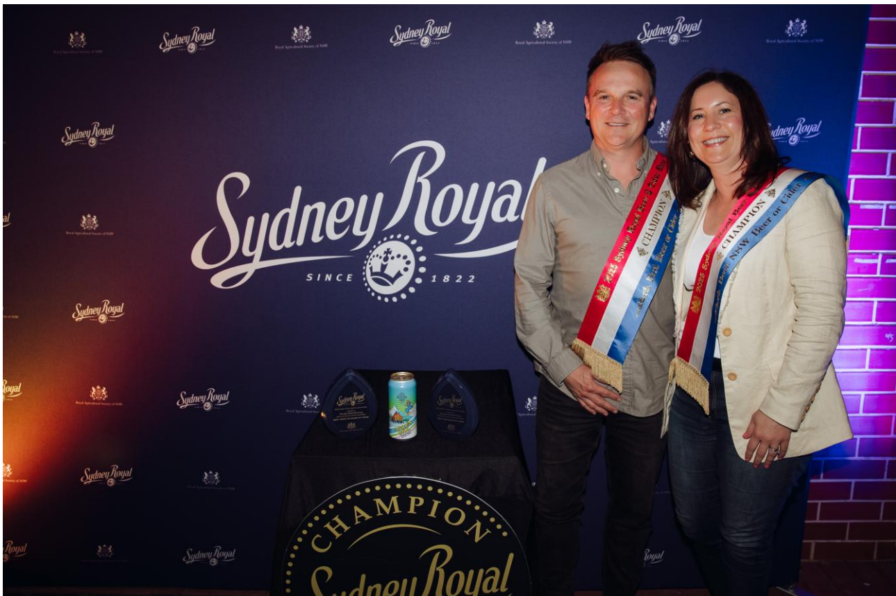
2025 Sydney Royal Beer & Cider Show NSW and Best in Show Champion – Sunday Road Brewing Company

To further recognise local achievement, the competition also awards BEST NSW BEER or CIDER , highlighting outstanding excellence from a New South Wales producer.