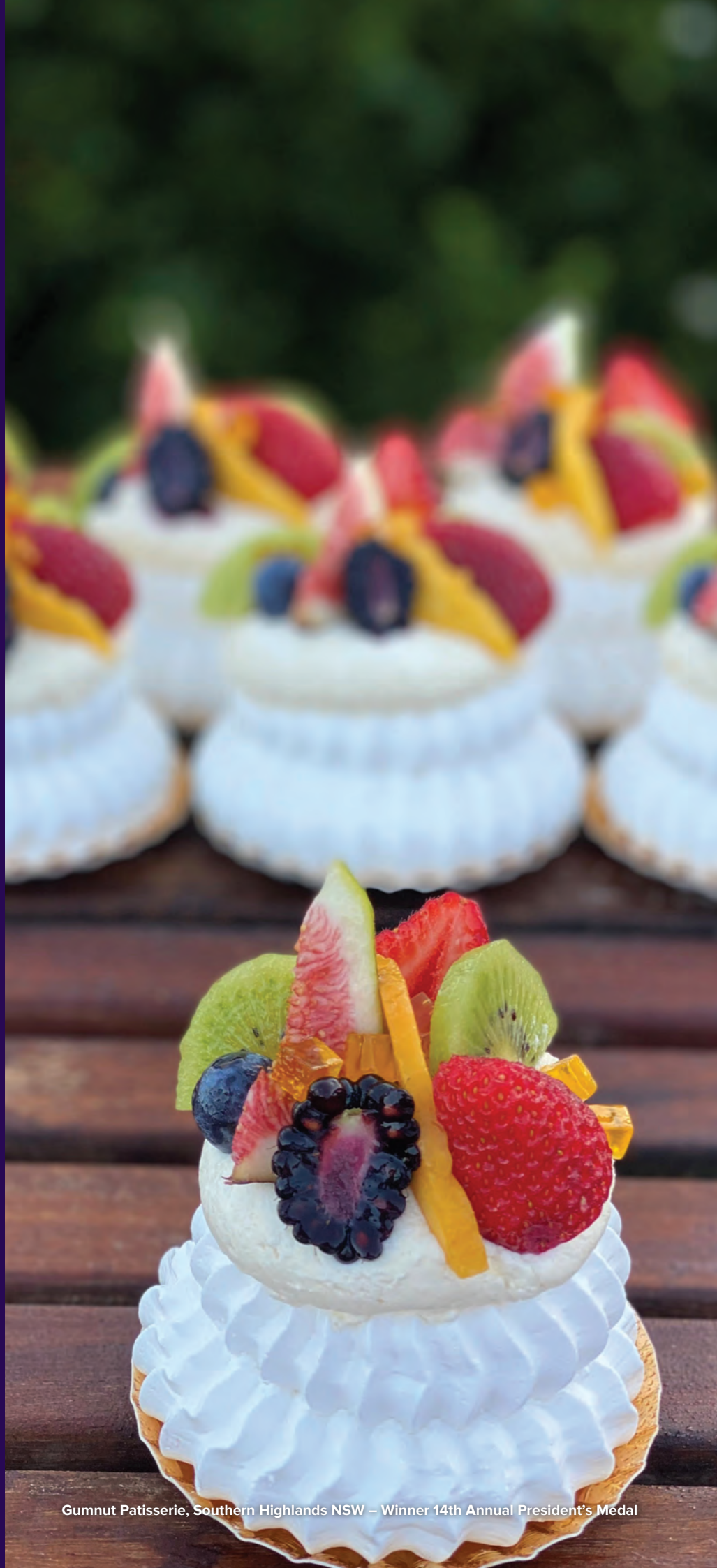
Gumnut Patisserie, Southern Highlands NSW – Winner 14th Annual President's Medal