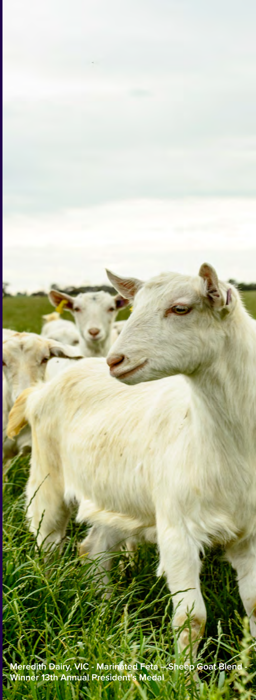
Meredith Dairy, VIC - Marinated Feta – Sheep Goat Blend - Winner 13th Annual President's Medal